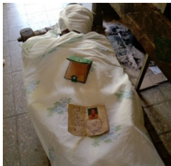
(e) Body of Aragaw Zenebe