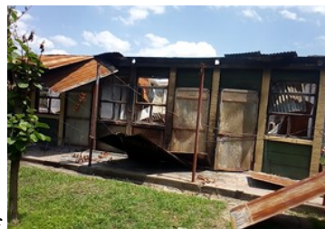
(e) Ataye town Administration offices