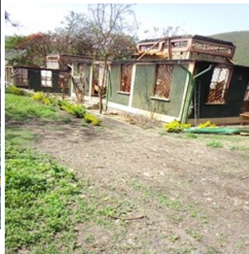
(b) Ataye town Water Supply Office