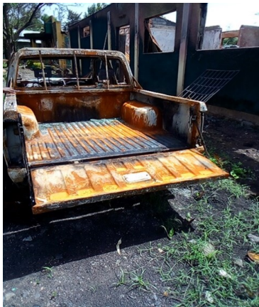
(a) Ataye Town Administration Urban Development Office Service

Entire governmental buildings in Ataye town, including 13 town administration offices and 11 Efratana Gidim Woreda administration offices, were burned down during the attacks. AAA further confirmed that all kebele administration offices in Jewha Kebele of Efratana Gidim Woreda was ransacked.