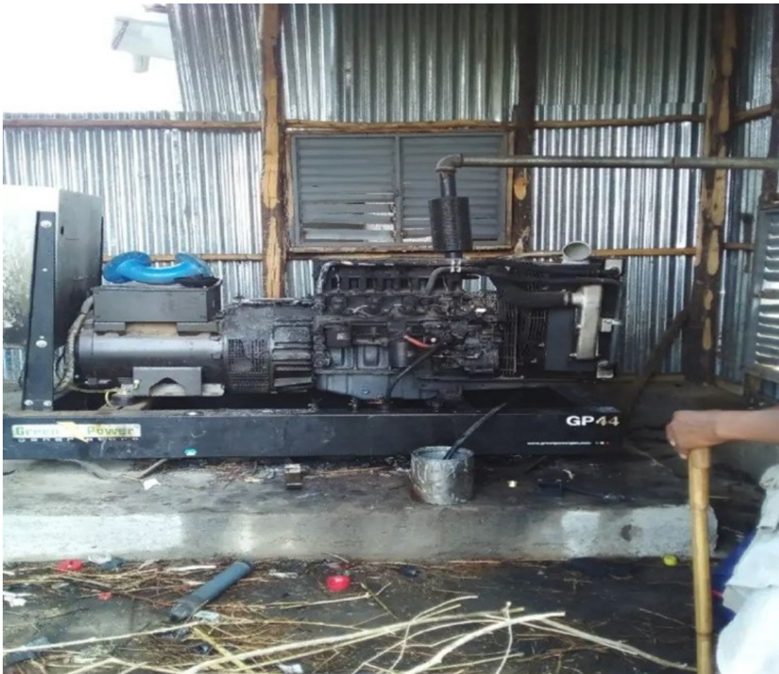
Figure 9: Picture showing Water Power Generator burned in Haile Mariam Kebele of Antsokiyana Gemza Woreda