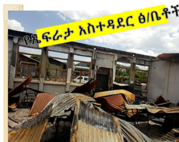
(d) Post-attack situation of Efratana Gidim Woreda Administration Offices [2/2]