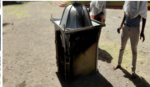
(a) Destroyed Jewha St George Church, (b) The dome of Debre Selam St. Efratana Gidim Woreda Michael's Orthodox Tewahedo Church