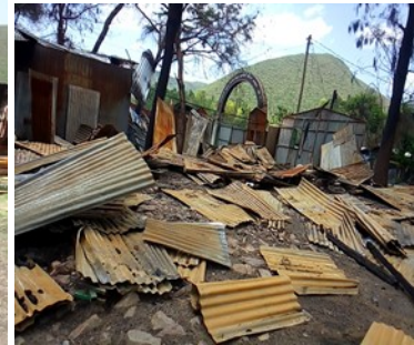
(c) Post-attack situation of Efratana Gidim Woreda Administration Offices [1/2]