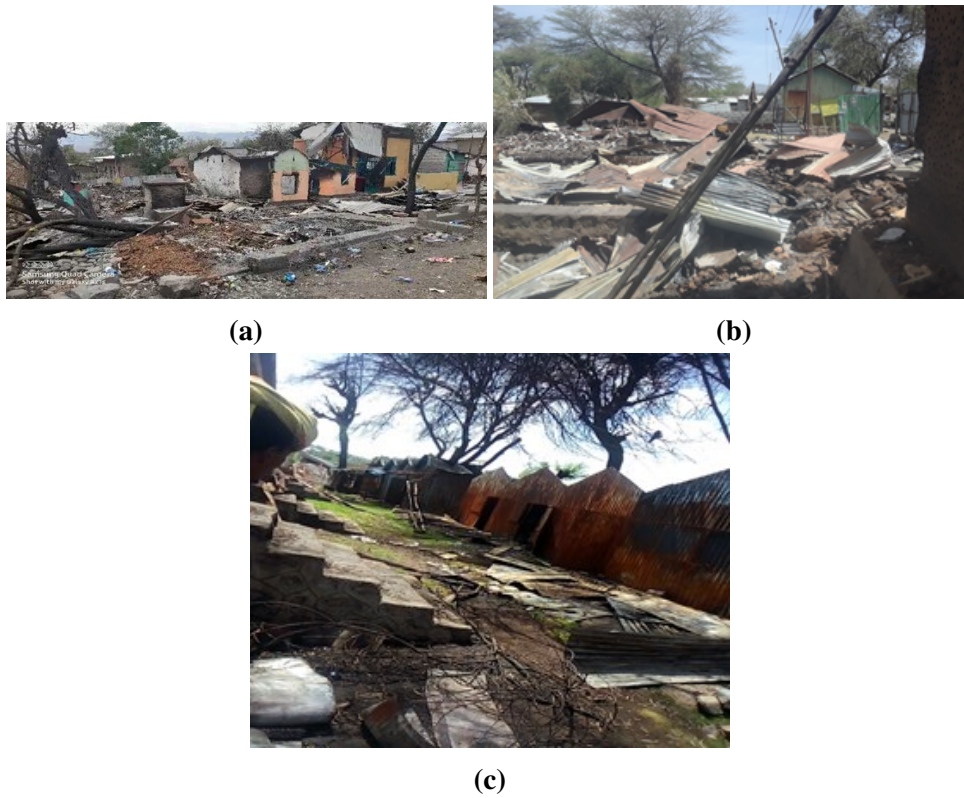
Figure 7: Pictures showing roadside facing buildings looted first and set ablaze next in Ataye town

confirmed that all roadside-facing buildings of Ataye town were completely destroyed.