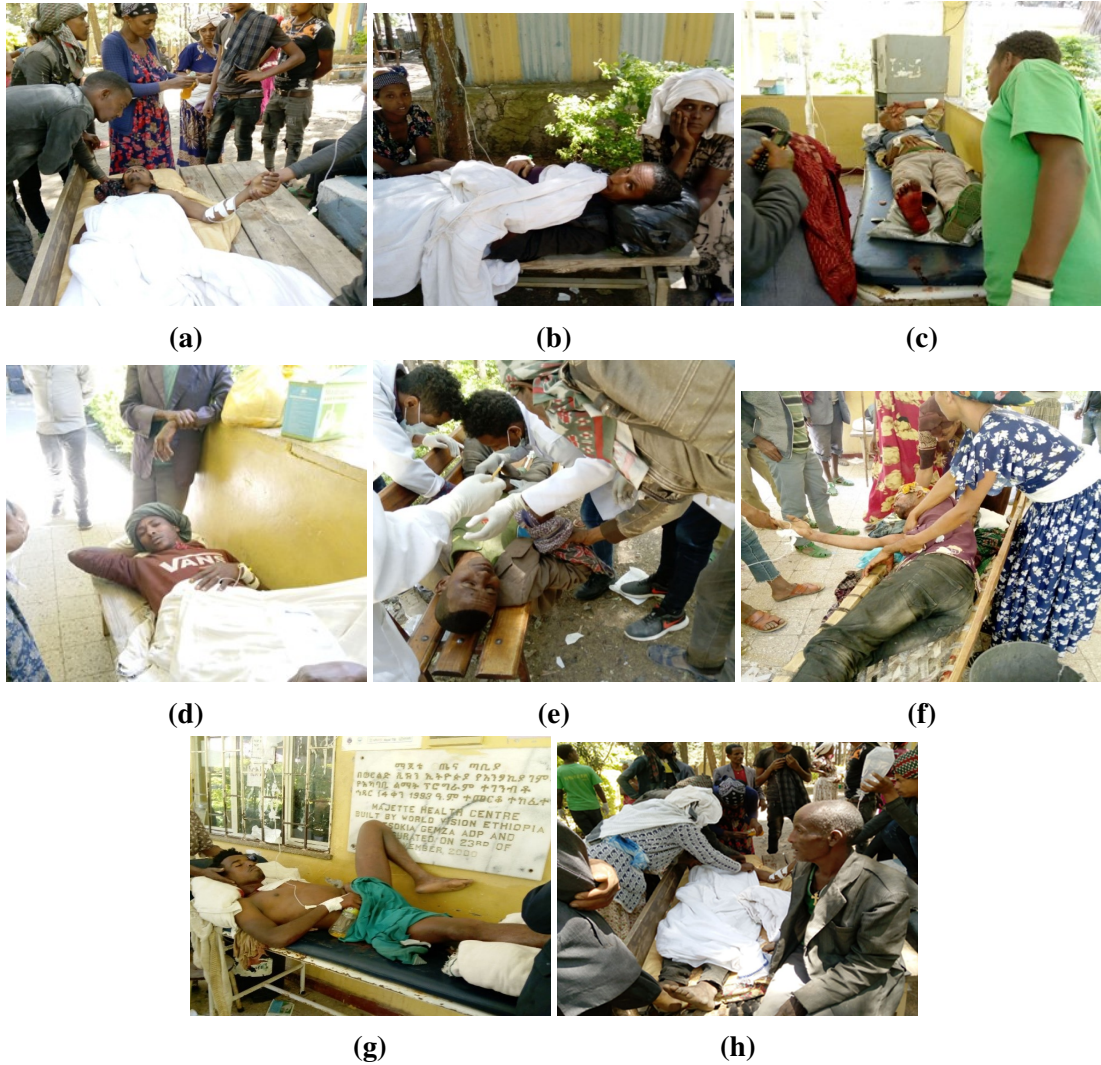
Figure 4: The images shown above are of victims from the March 2021 raid receiving treatment at Majete Health Centre